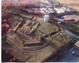
(Source: https://www.battlefields.org/learn/civil-war/battles/fort-mulligan )

Fort Mulligan (100 Mulligan Drive) Federal or Confederate troops occupied this strategic hill and the surrounding area near Petersburg, West Virginia as early as August 1861. Union forces used the fort to quarter troops patrolling against Confederate raids on the Baltimore and Ohio Railroad to the north, and as a "jumping-off" point for their own raids further south.