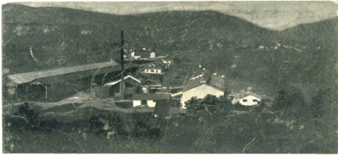
Riverside Tannery before the fire of January 24, 1900. I would like to be just a tannery worker. Received good pay. Like to be just a tannery worker.

Brighton Tannery (site of Pizza Hut and McDonald's) The tannery business came to Petersburg in 1890. Since then, several companies ran the tannery. Petersburg Tannery purchased the site in 1950 and conducted business until 1974. For 84 years, the Tanning Business and Petersburg were linked.